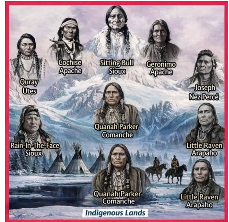
Legends who stood for their people