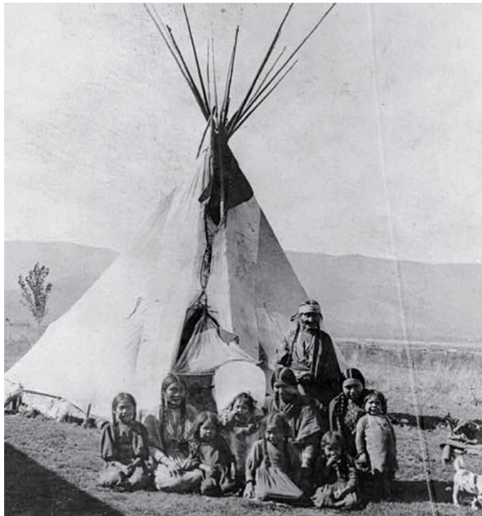
A thriving family of the Snake River tribes... Idaho, 1902...