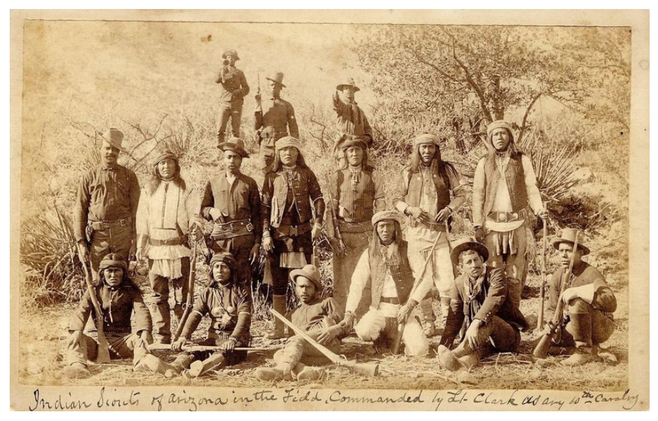
Apache Scouts & Buffalo Soldiers, V.S. 10th Cavalry,