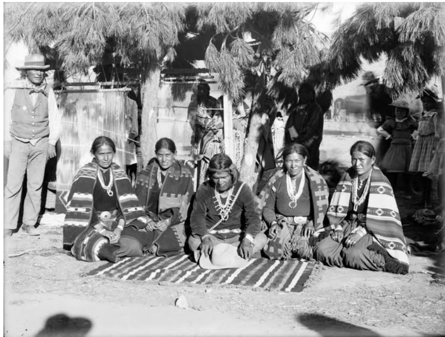
Navajo group. 1901-1906.