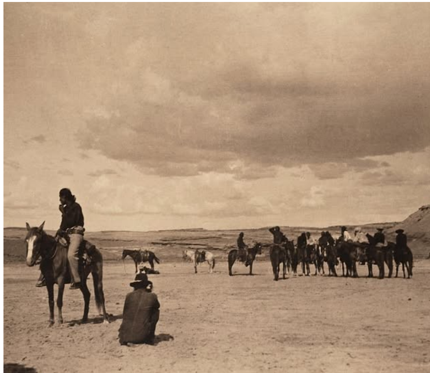
Meeting of the Clan. Navajo at the entrance of the Canyon de Chelly Northeastern Arizona. ca. 1900.